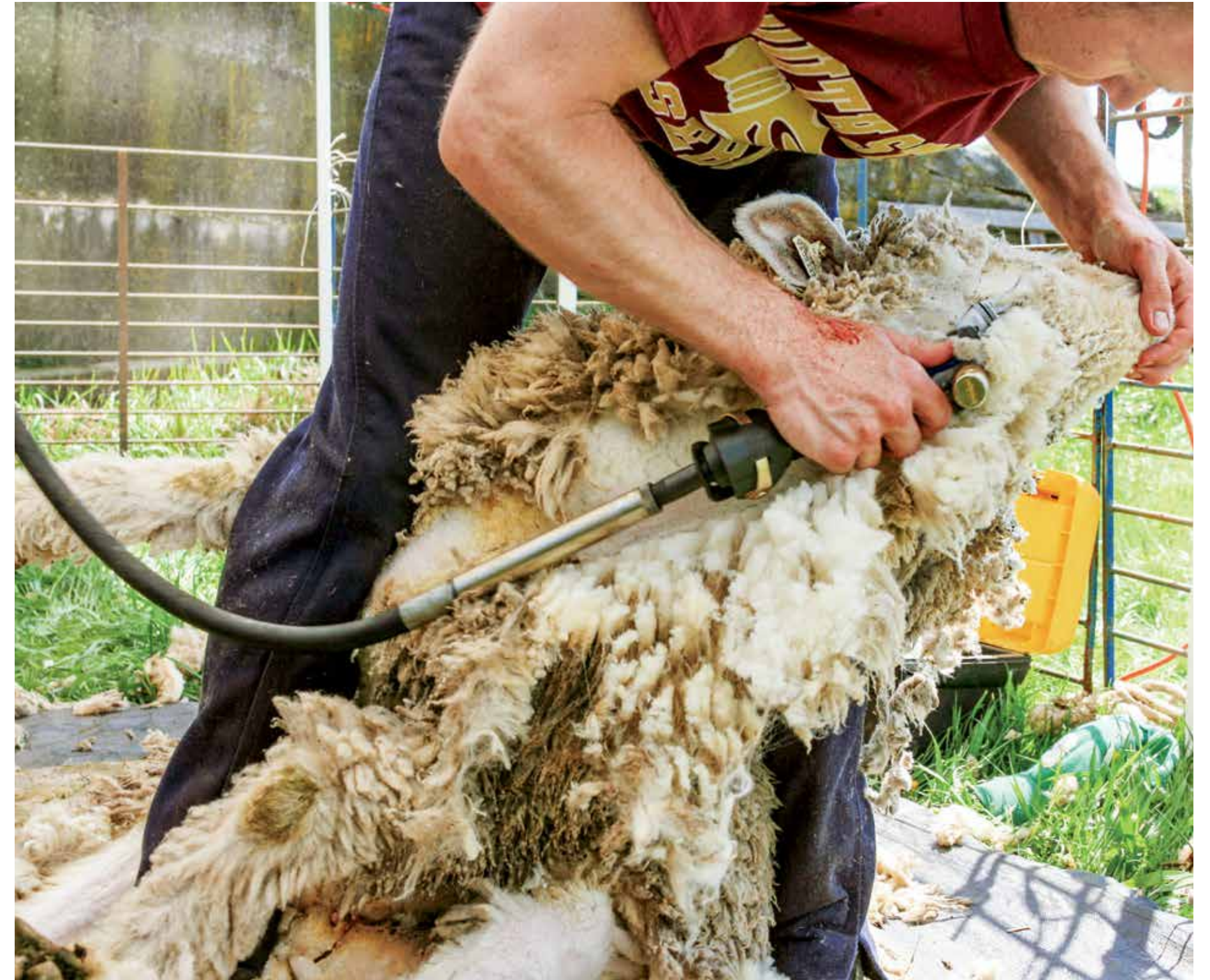
A skilled shearer must avoid cutting the animal or creating second cuts, which reduces the value of the fleece. Cutting oneself, however, goes with the job. Cestari Sheep and Wool Company. Churchville, Virginia.