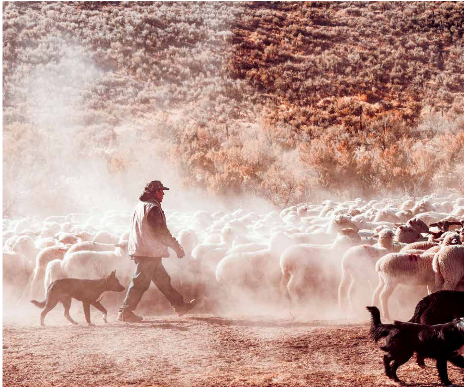
Moving sheep between pastures can often be an all-day event, sometimes more. It requires a skilled shepherd and an equally skilled dog—several of them. Flat Top Sheep Ranch. Carey, Idaho