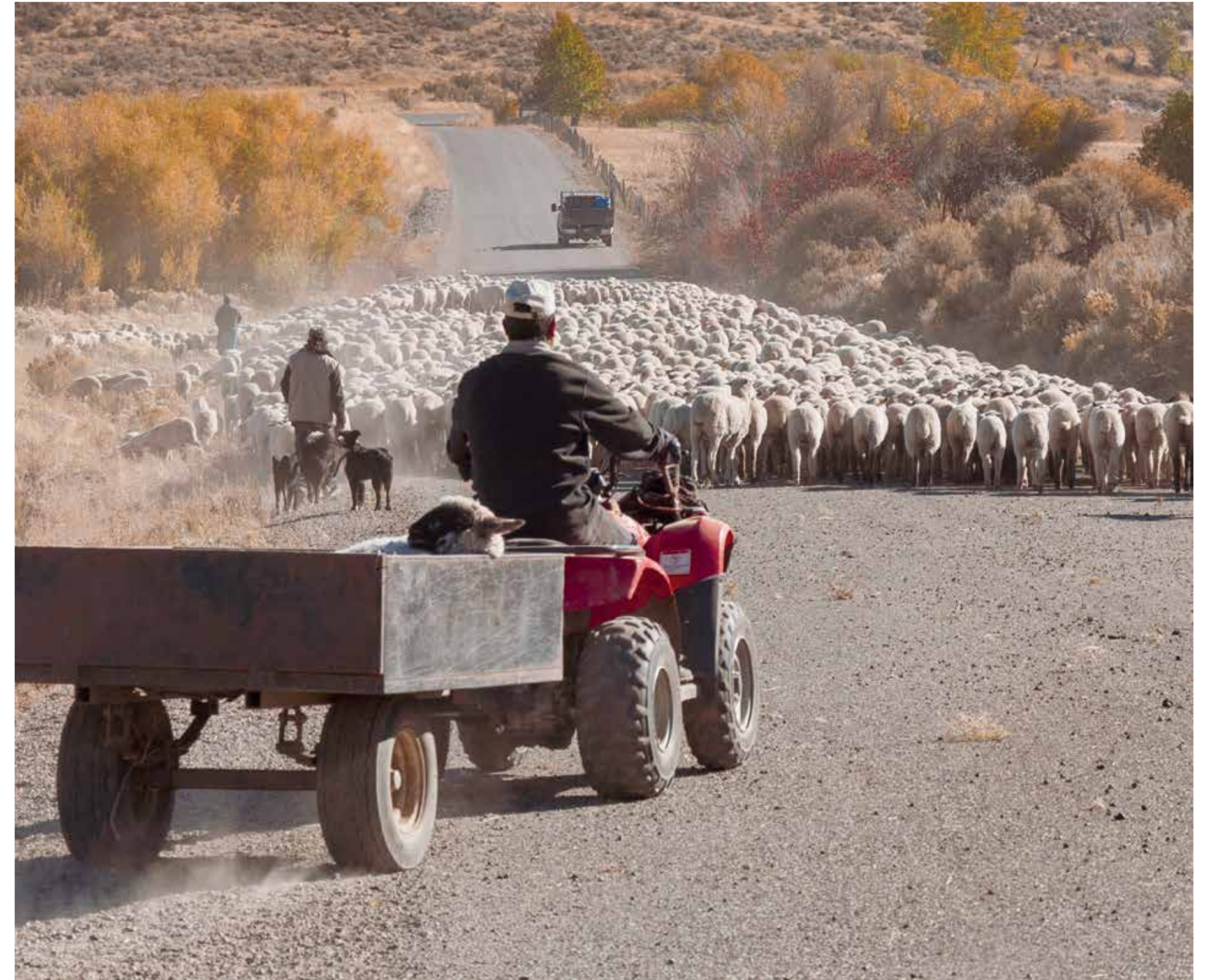
All terrain vehicles are an easier form of horsepower. They also make it easier for a sheep with sore feet. Flat Top Sheep Ranch. Carey, Idaho