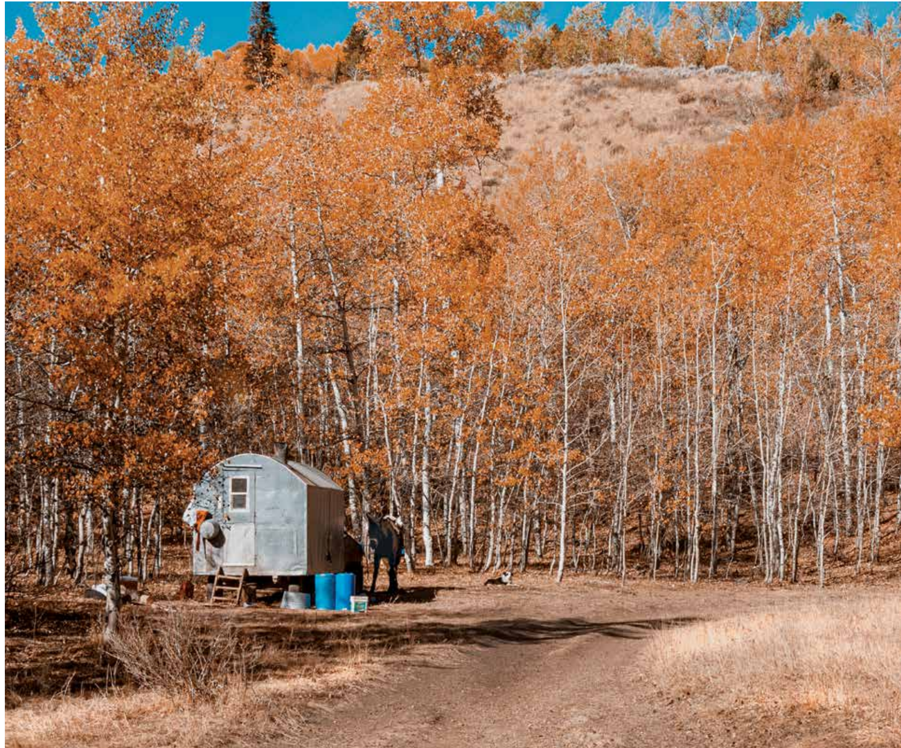
Sheep wagons are still used extensively throughout the American West. Similar to the covered wagon that transported pioneers across the country, sheep wagons are now designed with propane for cooking, and charging power for cell phones. Noh Sheep Company. Kimberly, Idaho.