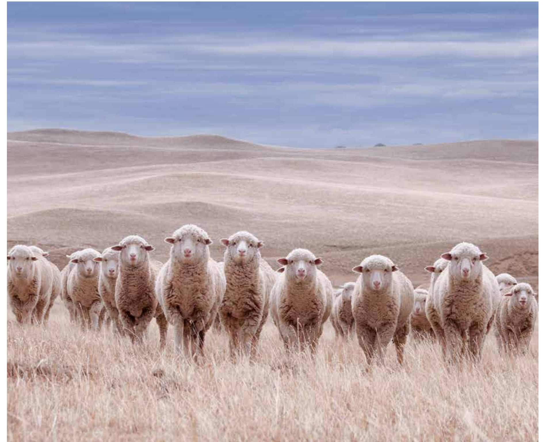
The vast expanse of the American West can still accommodate large herds, unlike most other parts of the country where large flocks aren't economically viable due to the price of real estate. Rambouillet herd. Camino "Kid" Ranch, Buffalo, Wyoming.

And then there are the other "fiber" ungulates: goats, musk ox, bison and alpacas. A wonderful coming together of fiber animals from afar, underscoring the fact that man—like animal—has roots the world over.